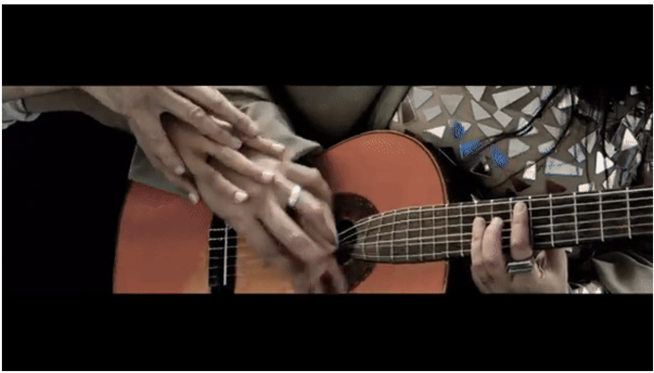
Watch "TURBULÊNCIA" here.